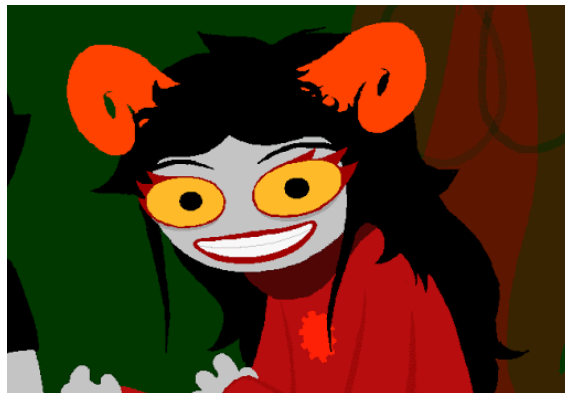
The ghost and death enthusiast.