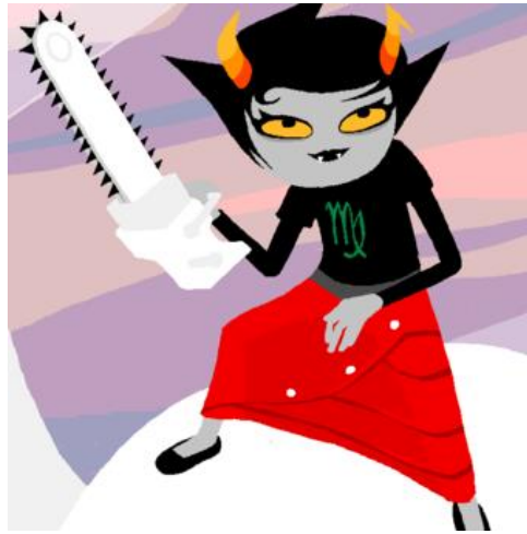
Fierce chainsaw-wielding fashionista troll.