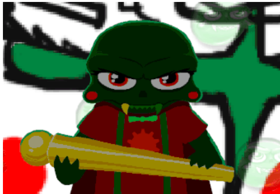
The twin that's chaotic evil.