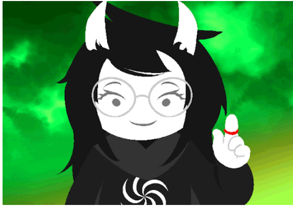
Average scientist, except part dog!