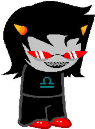
Terezi Pyrope ♏