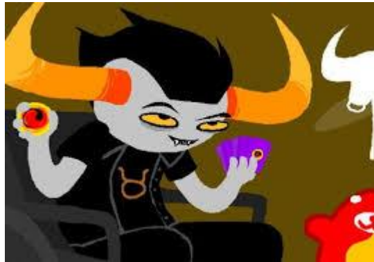
Socks and Sandals meet Yu-Gi-Oh!