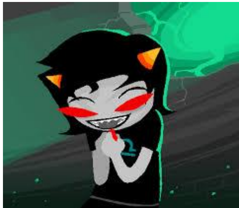
Blind troll who LOVES red.