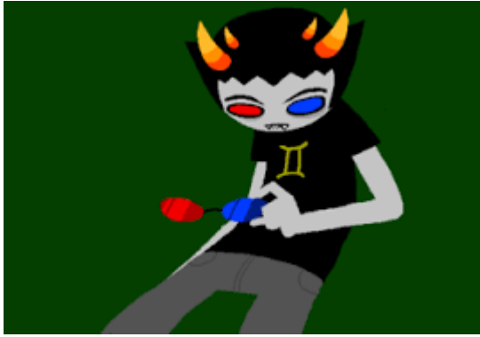
Bee-loving gamer, times two.