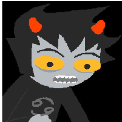
The short, loud, crabby leader.