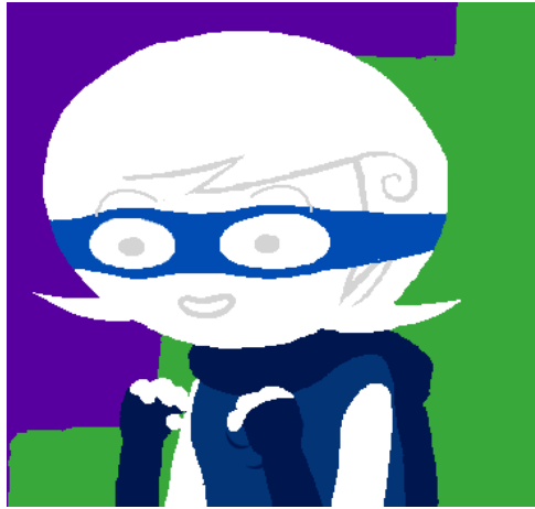
The uncontrollable cat-mom figure.