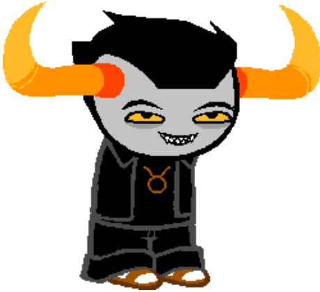
Tavros Nitram ♉