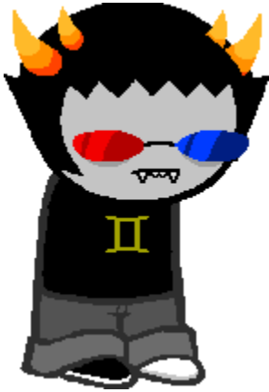
Sollux Captor ♊