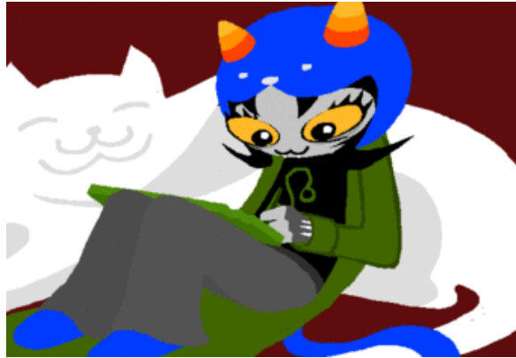
Hopelessly romantic feral cat troll.